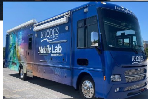
Ann Best, assistant dean of health sciences and public service at Rhodes State College, demonstrates the Anatomage table in the Rhodes in Motion motor lab, shown at left.