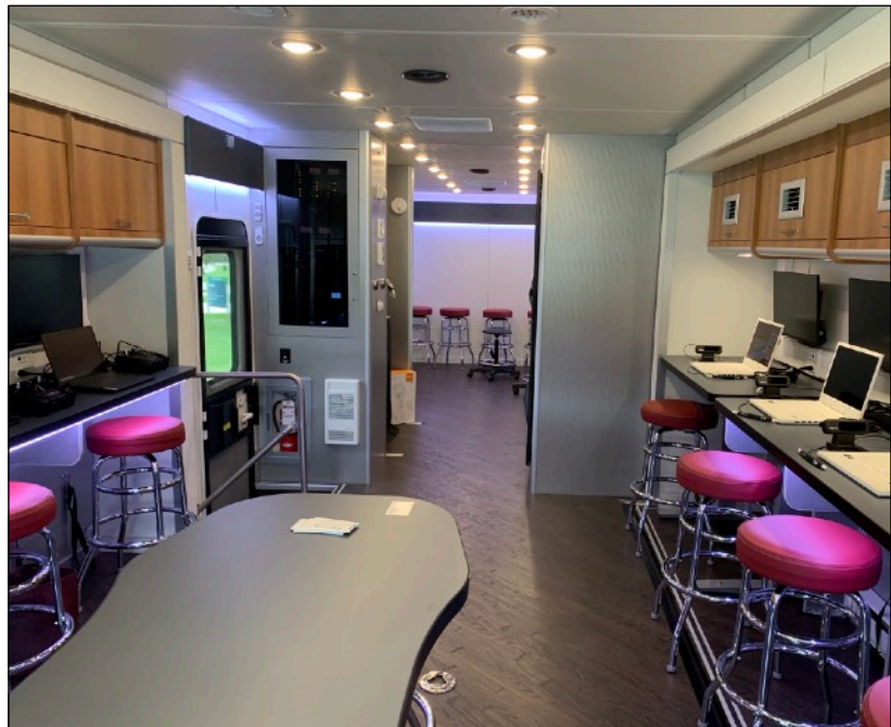
The Rhodes in Motion motor lab is designed to allow students to utilize several of the different technological features at the same time.

Soil sample collection equipment including SMS Farming Software , which allows students to capture